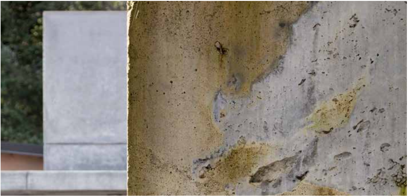
The erosion wall is a living piece of art. Objects embedded in the cast-in-place-concrete by the homeowner will be exposed over time through the effects of time and water.

Energy efficiency was built into the 12-foot high, 15-inch thick concrete walls. They contain 4-inch thick, foam-sheet, vapor barrier insulation. This reduces the need for artificial heating and cooling. From the top of the concrete to the roof, walls are conventionally framed and clad with a rain-screen of reclaimed lumber from redwood logs felled over 100 years ago. Deep, overhanging eaves are angled to guide the rays of winter sun to the stair atrium's passive solar concrete wall. The butterfly roof configuration conceals the south-facing wing of the photovoltaic roof panels, which cover 60 percent of the roof area.