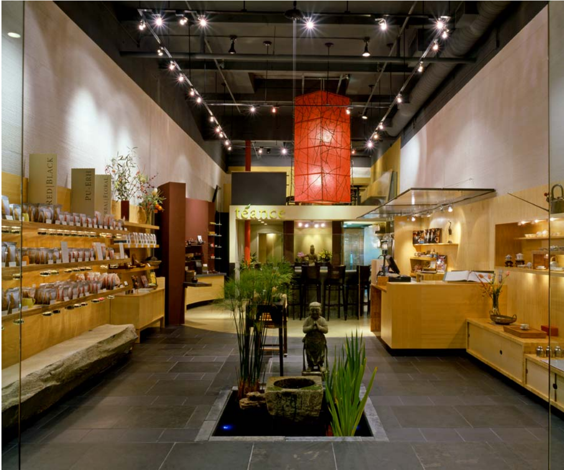
Teance, Berkeley, CA — IIDA-NC Honor Award, Commercial Interior Design An atmospheric retail environment designed to introduce, enhance and complement the culture of fine tea and the Teance brand.