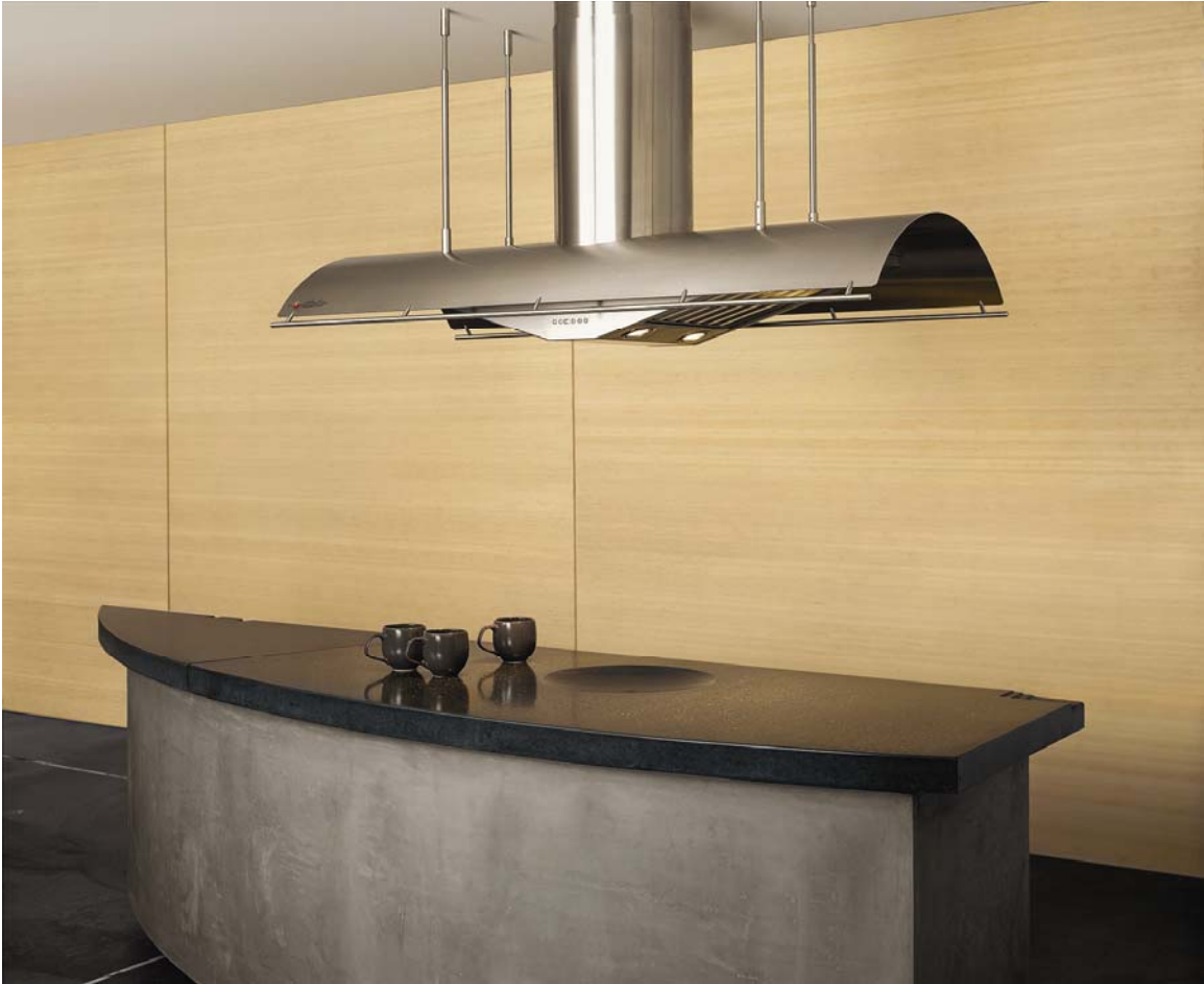
Form in balance: Trapeze, from Cheng Design by Zephyr; Good Design Award winner