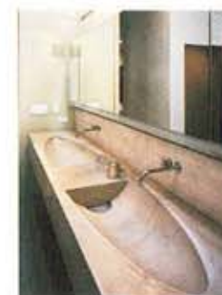
Facing page: Glass shower walls ensure that the clean lines of this bathroom design are uninterrupted.